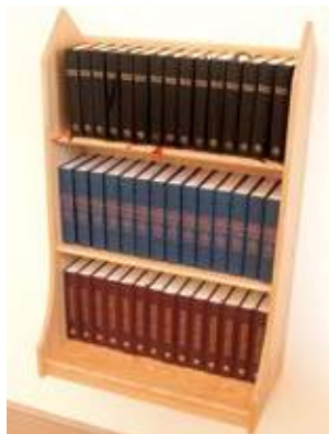
St Deiniol's Library Chapel, Hawarden Hymn book shelf styled to fit with the chapel's architectural design.

Woods can be chosen and designs made to match existing furnishings or reflect a more contemporary taste.