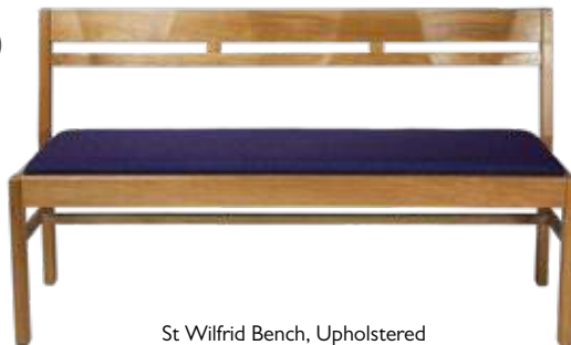
St Wilfrid Bench, Upholstered