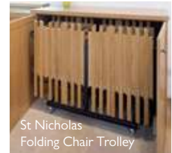
St Nicholas Folding Chair Trolley

Churches often choose one of the bespoke designs already developed by Treske but with variations to suit their needs: these can range from the depth of a hymn book shelf to the wood a chair is made of. However we also develop new designs for customers through working carefully with them to understand what is needed and appropriate to historic buildings.