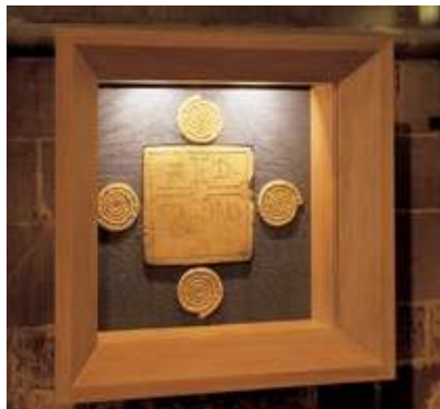
St Hilda's, Hartlepool

The display of precious and historic objects requires specialised, custom-made cabinets, cases and cupboards. Treske collaborate with architects, historians, archivists, conservation experts and clergy to guarantee that conservation, security and access are addressed as equally important factors in their design and construction.