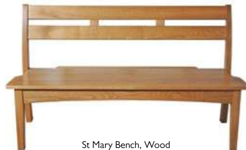
St Mary Bench, Wood