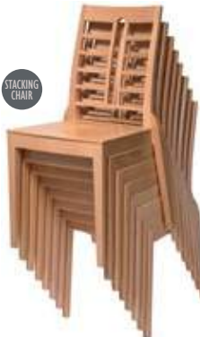
Modern Stacking Chair, Wood