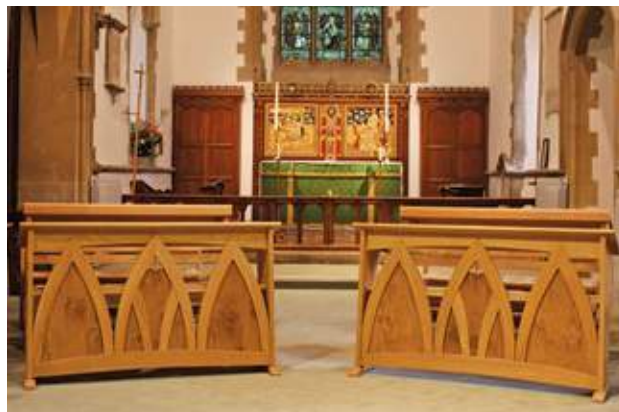
St Mary's, Princes Risborough

Stalls with privacy panels designed in the same style as the seating.