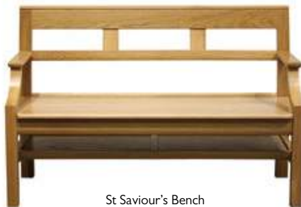
St Saviour's Bench