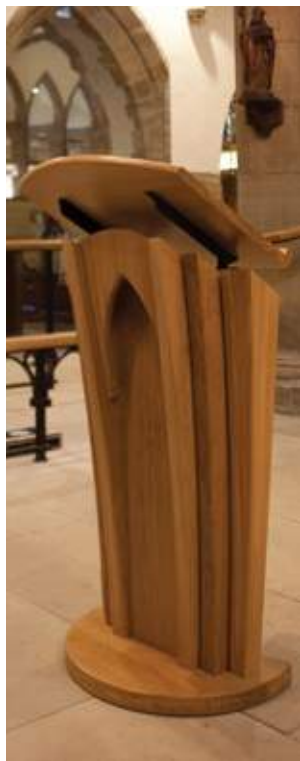
St Chad's, Headingley A rising tapered base conceals a shelf and the support for the adjustable reader.