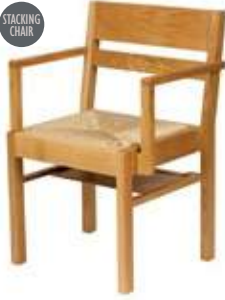
St Wilfrid Arm Chair, Rush