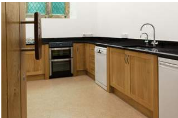
St Andrew's, Epworth Church servery with fitted appliances and boiling water tap.

Whether such provision has been required within the ancient fabric of heritage buildings or in brand new visitor facilities, Treske have provided practical, durable and beautiful solutions in finely crafted hardwoods.