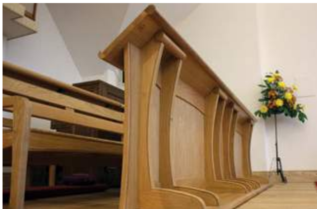
All Saints, Darlington

Movable choir stalls with full privacy screen, reader and book shelf.