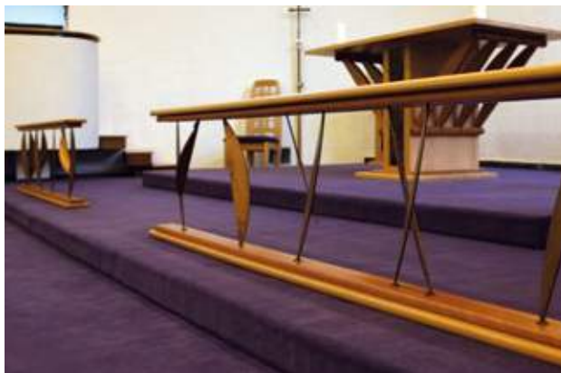
All Saints, Hale Barns

Such rails delineate the space in which the altar or communion table stands for the serving of communion to the congregation. In modern times it is more likely to signify a meeting place between clergy and people rather than, as was once the case, a barrier between them.