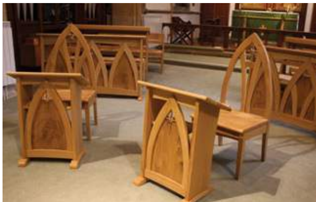
St Mary's, Princes Risborough Elegance accentuated by gothic curves, using the pilgrimage star cast in bronze as a central feature.

Clergy chairs and litany desks form part of the architecture of the sanctuary space and as such should be formal in character and have weight and presence whilst complementing the aesthetic and style of their setting. Great cathedrals, ancient chapels and modern churches have all commissioned Treske to design and make unique furniture which matches the special occasions of ritual and ceremony for which they are required.