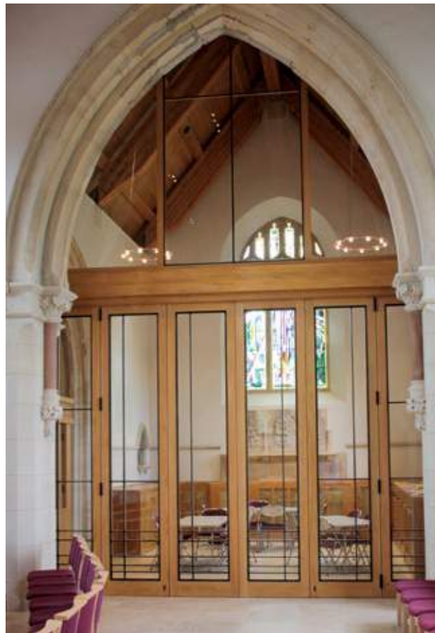
St Nicholas, Radford Semele Caroe & Partners glazed folding door screen and arch above.