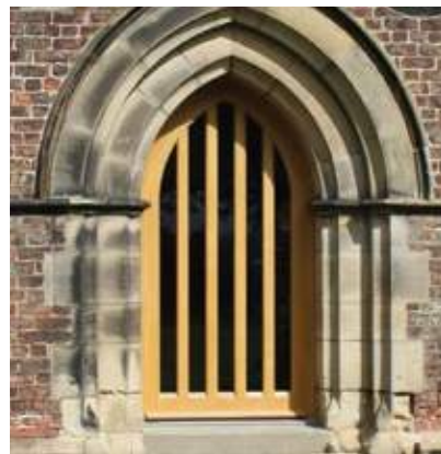
St Peter's, Wolviston Full length, glazed panel exterior door.

Treske's skilled craftsmen and cabinet makers are experienced in making doors, screens and panelling for any situation. In historic buildings they work with conservation architects to preserve the integrity of ancient fabric whilst fitting new doors, glazed porches, cupboards and panelling. They are often required to match exactly the style, colour and even aged look of existing woodwork.