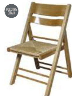
St Nicholas Folding Chair