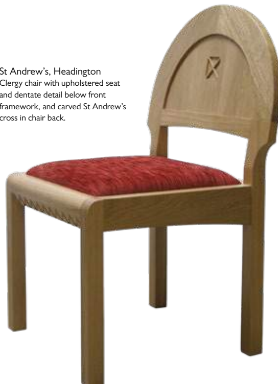
St Andrew's, Headington Clergy chair with upholstered seat and dentate detail below front framework, and carved St Andrew's cross in chair back.