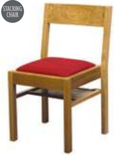
St Magnus Chair, Upholstered