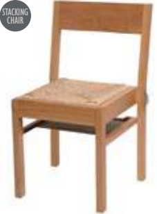
St Magnus Chair, Rush