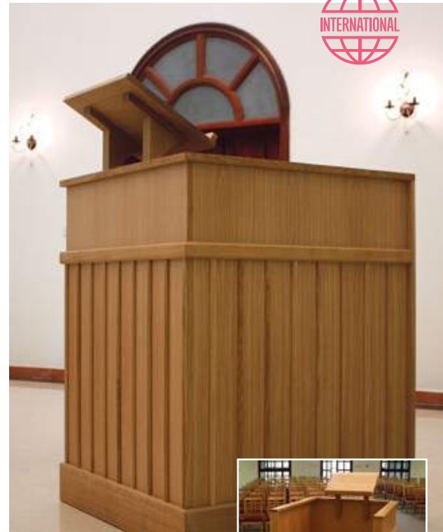
Al Ain Crematorium, UAE Box pulpit with reader and internal stool.