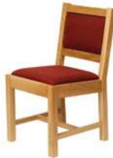
Alton Chair, Upholstered