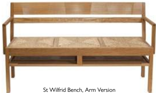
St Wilfrid Bench, Arm Version