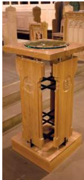
St Barnabus, Linthorpe Designed by Ferry & Mennim Architects, made in steel and oak, with detailed carving.