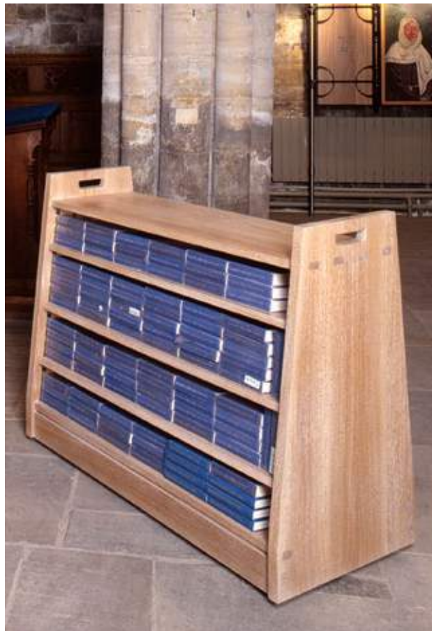
St Hilda's, Hartlepool Movable display stand and hymn book trolley in fumed and limed oak.