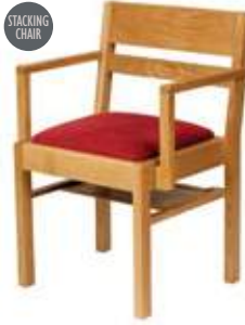
St Wilfrid Arm Chair, Upholstered