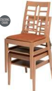
Modern Stacking Chair, Upholstered