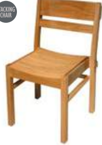
Southwell Chair, Wood