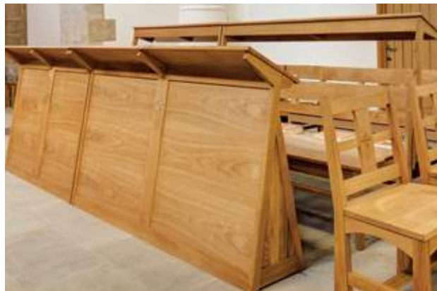
St Giles', Pontefract

Fixed choir stalls can limit the forms taken by contemporary worship and the wide range of musical and community events which take place in churches. The result is that many churches are now commissioning more flexible seating which is still capable of fulfilling the needs of choirs. Treske have made a number of handsome replacements, many with innovative technical features.