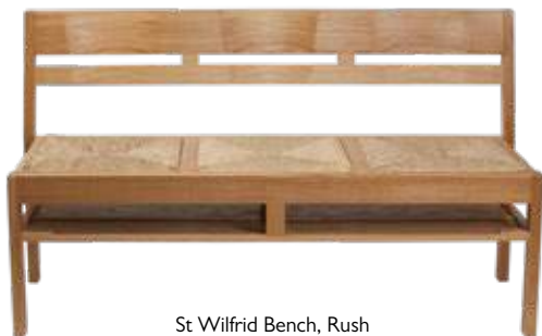
St Wilfrid Bench, Rush