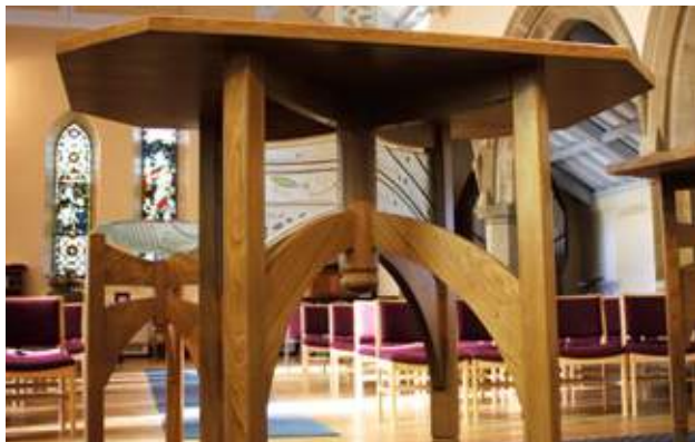
St Alban's, Windy Nook

Movable and with dichroic glass imagery fused into glass panels, the design lead is from Holy Island.