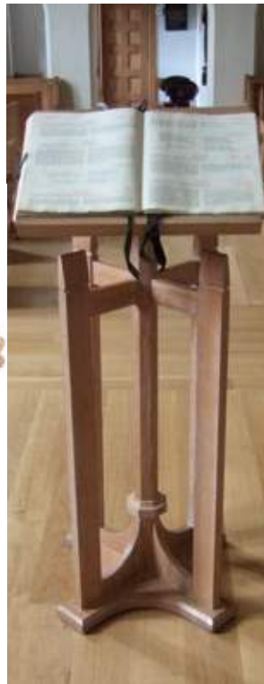
St Benet's Hall, Oxford University Designed by Martin Stancliffe Architects and made in limed oak.