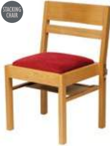
St Wilfrid Chair, Upholstered