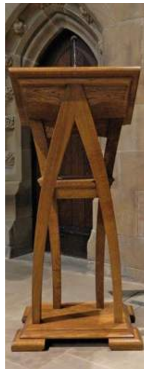
St Batholomew's, Wilmslow Tapering gothic arches front the lectern, with opposing back legs supporting the fixed height reader.