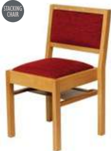
St Magnus Chair, Fully Upholstered