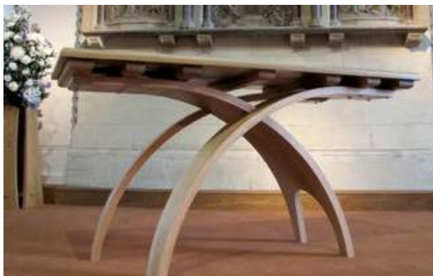
St Peter's, Farnborough

Strong tapering gothic arches are used to create an uplifting and elegant altar design.