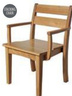
St Mary Arm Chair, Wood