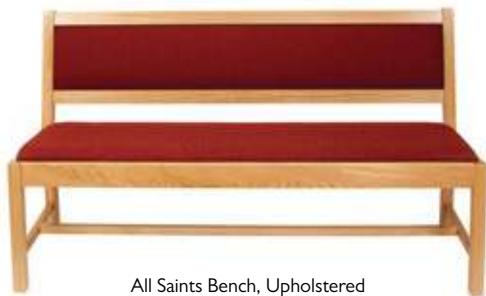
All Saints Bench, Upholstered