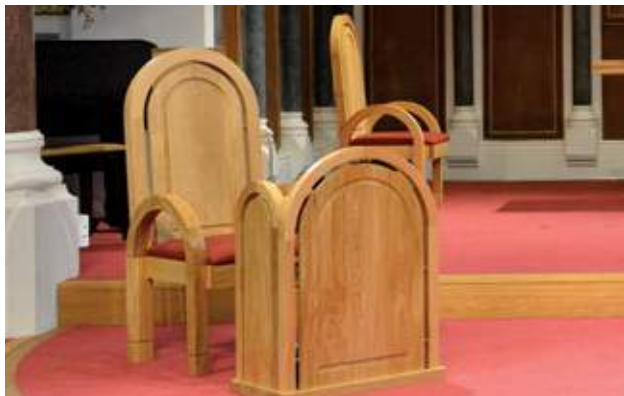
St James, Gerrards Cross

Part of the sanctuary furniture set using curves and oak panels to complement the Byzantine style church interior.