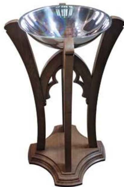
St George's, Stockport Spun brass silver-plated bowl cupped by oak stand.