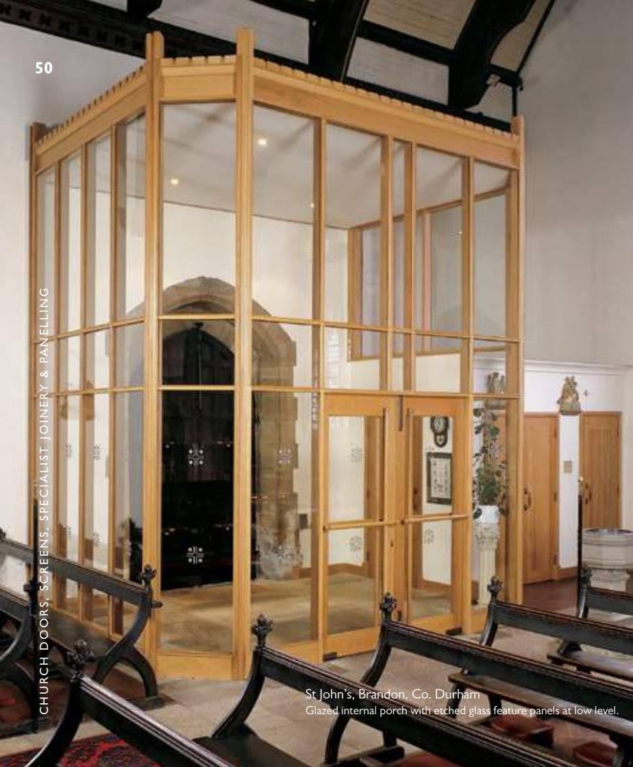
St John's, Brandon, Co. Durham Glazed internal porch with etched glass feature panels at low level.