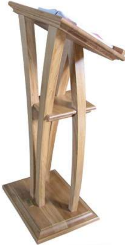
St Andrew's, Coulsdon Graceful oak arches rising from a solid base support the reader.