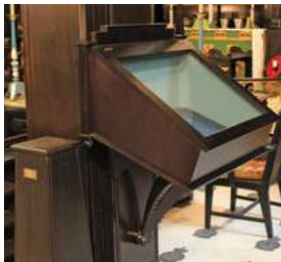
St Clement Danes, London