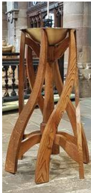
St Wilfrid's, Standish The form reflects the symbols of the ship, staff and baptism associated with St Wilfrid.