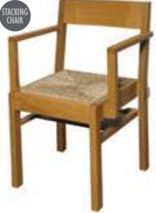
St Magnus Arm Chair, Rush