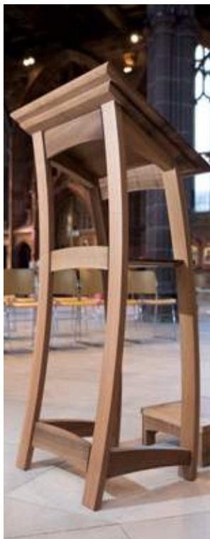
Manchester Cathedral The beautiful, curved shape legs support a generous reader, and provide space for a small stool to fit at the base.