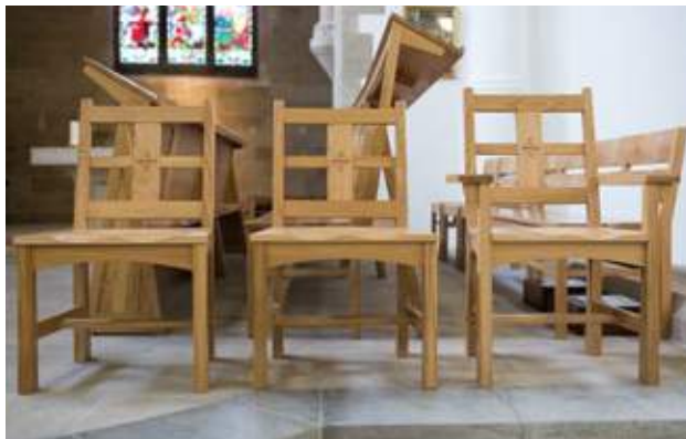
St Giles', Pontefract Celebrant chairs in an Arts and Crafts style designed to link with congregation seating.