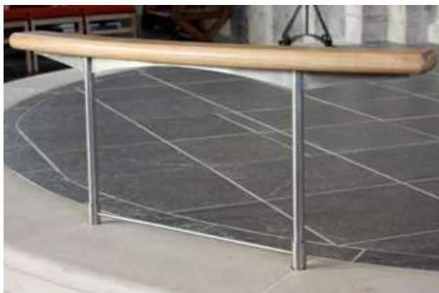
St Lawrence, Church Stretton

The movable altar rail uprights are made in steel with a patinated finish.