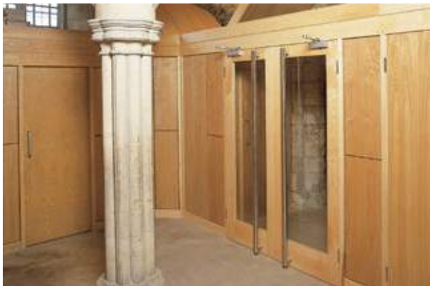
St Hilda's, Hartlepool Internal doors, a WC and boiler housing built within the west tower.