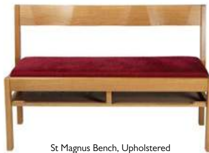
St Magnus Bench, Upholstered