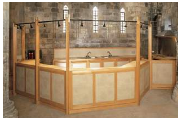
St Hilda's, Hartlepool Limed oak and panelled kitchen area.