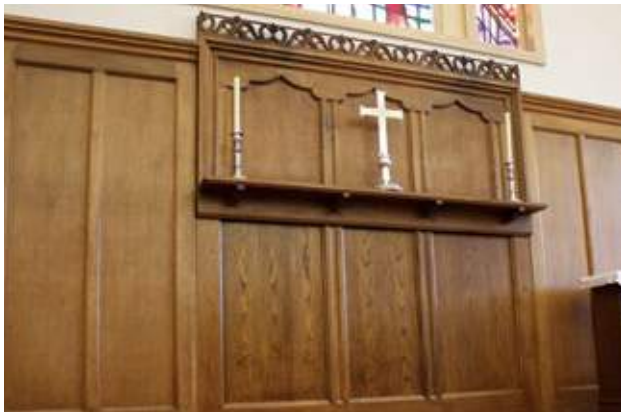
All Saints & Salutation, Darlington New panelling alongside converted panelling from the original church.