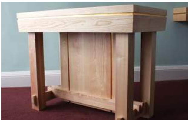
Wydale Hall, Diocese of York Conference and Retreat Centre Altar, made in ash, with gold leaf set into the edge detail.