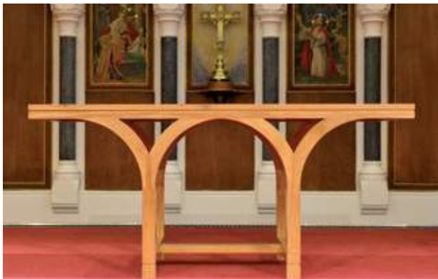
St James, Gerrards Cross The altar reflects the Byzantine style of the church columns.