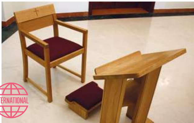
Al Ain Crematorium, UAE

Radial seating and desks for groups of up to 16, set around an English cherry and sycamore altar.