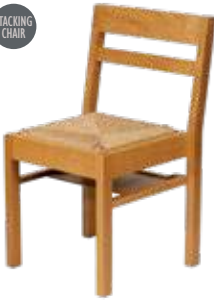
St Deiniol Chair, Rush