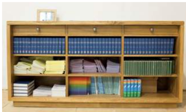
St Andrew's, Epworth Welcome desk incorporating book storage.