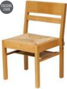
St Wilfrid Chair, Rush