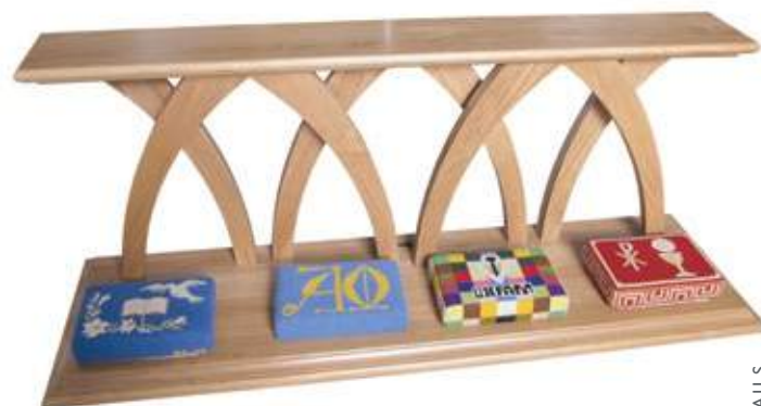
St Andrew's, Coulsdon

Removable stainless steel uprights support oak altar rails.