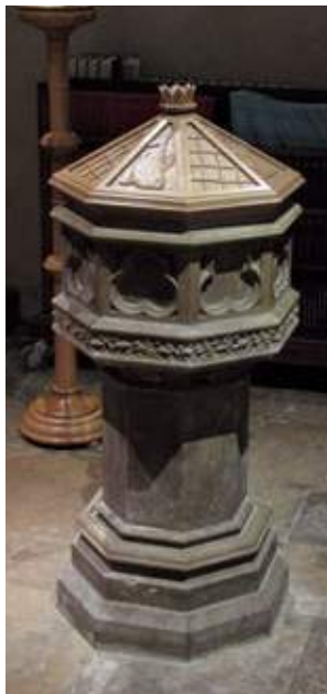
St Andrew's, Headington A new font cover with carved fish and net circling a crown motif.

In early days fonts were large enough to allow adults to stand and be immersed in them. Early fonts did not have covers but from 1236 fonts were covered and locked so that holy water could not be stolen. The modern font is usually much smaller, portable and designed to fit with other furniture within the church.