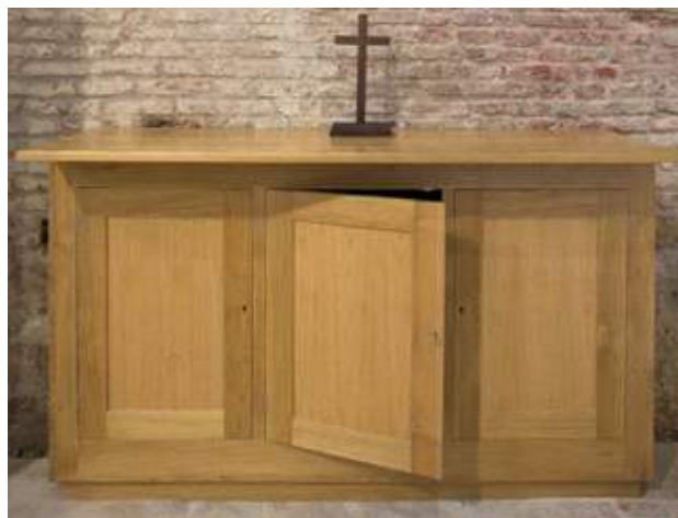
St Andrew's, Epworth Storage cupboard doubling as Lady Chapel altar and memorial bookstand, also covering a heating manifold.

Whilst regarding the integrity of historic fabric as paramount, they have been able to make and fit cupboards that match existing furniture and design and make new shelving or fittings where required, always after detailed discussions with church architects, Diocesan authorities, clergy and congregations.