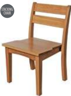
St Mary Chair, Wood