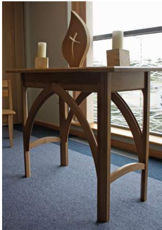
Oxford DAC, Church House, Diocese of Oxford Bespoke altar design in oak for the chapel in the new offices of the Diocese of Oxford.