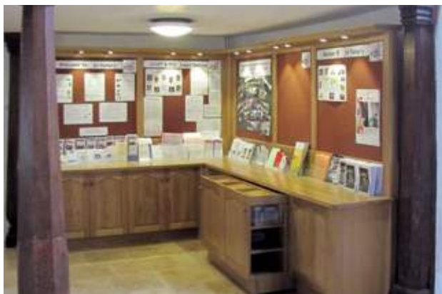
St Peter's, Farnborough Servery and storage area, set below a balcony, with integral book trolley.