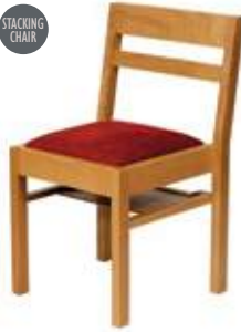
St Deiniol Chair, Upholstered