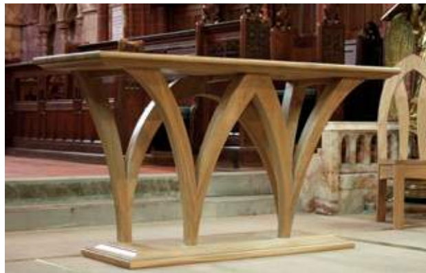
St Peter's, Hale

Movable and with dichroic glass imagery fused into glass panels, the design lead is from Holy Island.