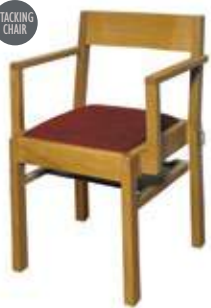
St Magnus Arm Chair, Upholstered